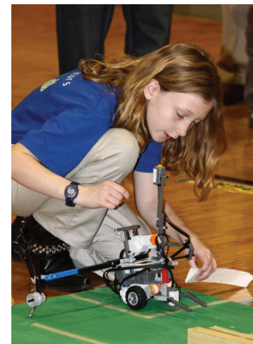
Team members at their scenarios on competition day.