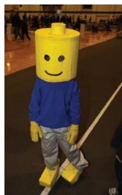
Twecky the Lego Man Mascot; costume made by student.

actual courses, each team also had to make an oral presentation, create a display booth, put together an explanatory note book, and show good spirit and sportsmanship throughout the day. All of these fields contributed to each team's final score.