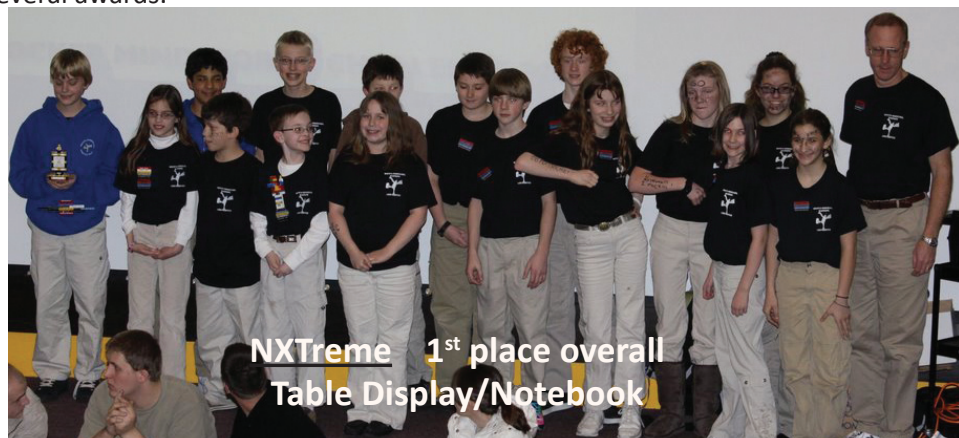
NXTreme 1 st place overall Table Display/Notebook